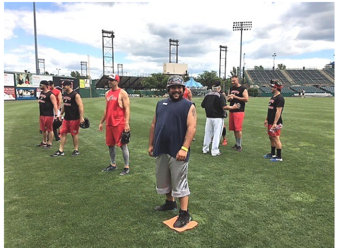
What's up Carnezz?

You can check out all of the great pics from our programs and events on our Facebook page! www.facebook.com/ArcSouthington