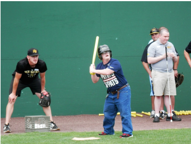
Hitting it out of the park!

For now, a very happy group of people with developmental disabilities in Southington can't wait for the next opportunity to play ball!