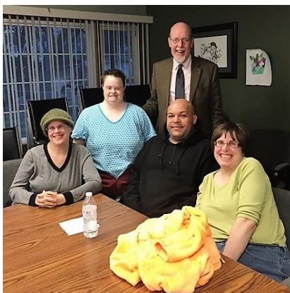
Self Advocates with Senator Joe Markley

The evening of March 30 th the Arc of Southington hosted a legislative meeting to connect the Southington area legislators with who we are and what we do.