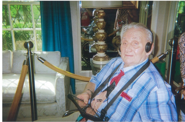
Chilling in Elvis's living room!