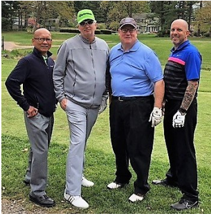
Golfers enjoying the beautiful day!

Mary and Judy recently attended a performance of Beauty and the Beast at Kennedy Middle School. The Recreation Department participants were treated to breakfast before the show, and pictures with the cast at its conclusion. Their day was complete after enjoying a delicious lunch at Kizyl's restaurant.