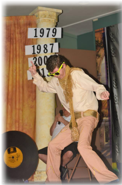
Elvis rocks the house to Hound Dog

Proceeds from the show helped to fund A New Way initiatives and events.