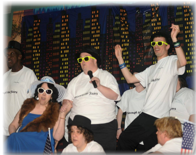
Ensemble cast performs New York, New York